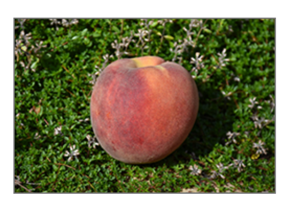
August Pride Peach fruit

A lovely fruit tree, bearing large, firm, juicy yellow freestone peaches flushed with red; quite ornamental, with amazing pink flowers in spring; susceptible to late spring freezes; chill requirement less than 300 hours; good disease resistance