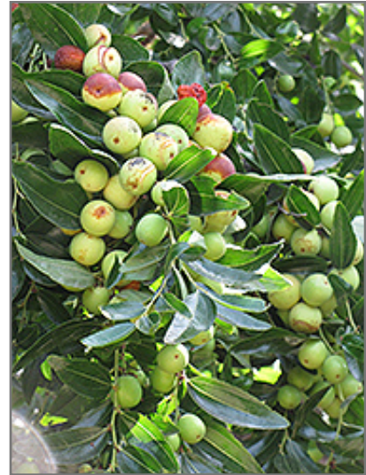
Li Jujube fruit