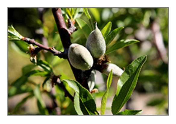
All-In-One Almond fruit