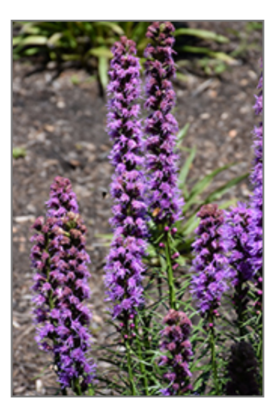
Trailblazer Blazing Star flowers

A vigorous, compact variety featuring sturdy, showy spikes of purple blooms that turn very dark as they mature; visually spectacular when massed together along a border or as a garden accent; easily grown, hardy and disease resistant