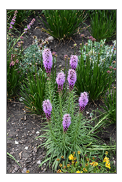
Blazing Star in bloom