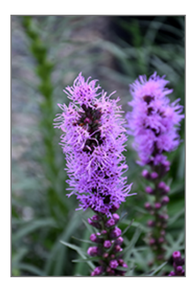
Blazing Star flowers

Blazing Star is recommended for the following landscape applications;