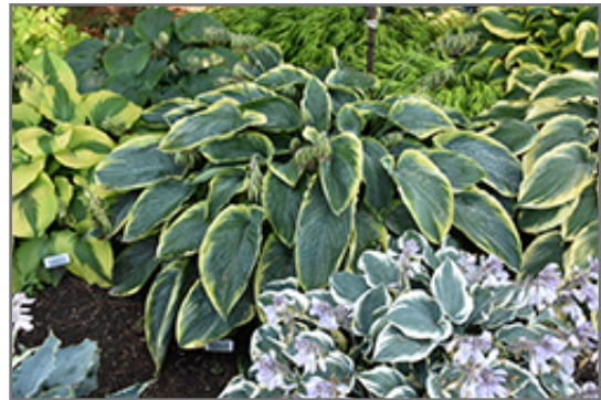
Shadowland Wu-La-La Hosta

Shadowland Wu-La-La Hosta is a dense herbaceous perennial with a mounded form. Its medium texture blends into the garden, but can always be balanced by a couple of finer or coarser plants for an effective composition.