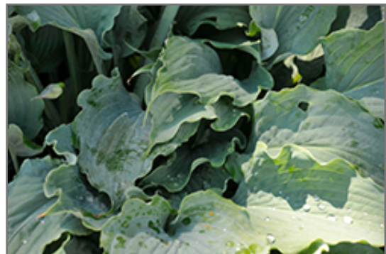
Wind Beneath My Wings Hosta foliage