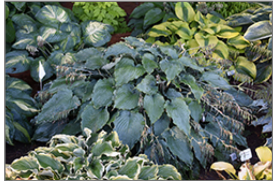
Wind Beneath My Wings Hosta

Wind Beneath My Wings Hosta is recommended for the following landscape applications;