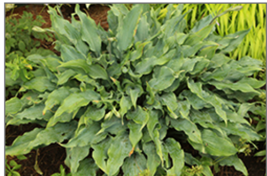
Wild Imagination Hosta