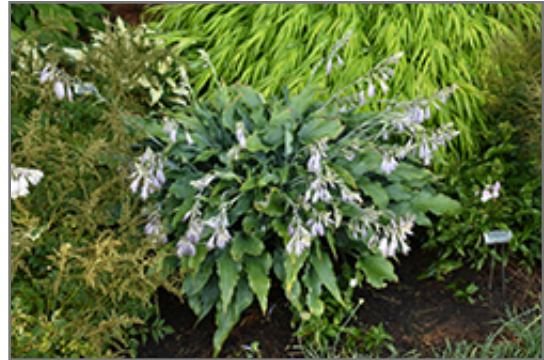
Wild Imagination Hosta in bloom

Wild Imagination Hosta is recommended for the following landscape applications;