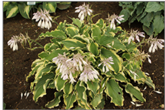
Shadowland Voices In The Wind Hosta in bloom