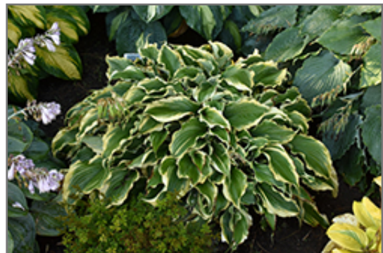
Shadowland Voices In The Wind Hosta