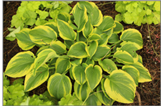
Twin Cities Hosta