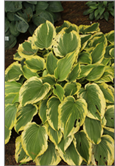
Trendsetter Hosta