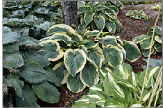
Terms Of Endearment Hosta

Terms Of Endearment Hosta is recommended for the following landscape applications;