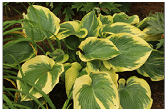
Terms Of Endearment Hosta foliage