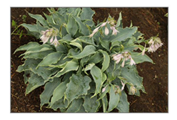
Tears In Heaven Hosta