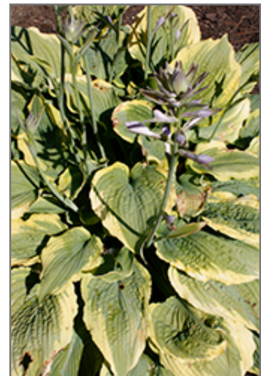
Spartacus Hosta in bloom