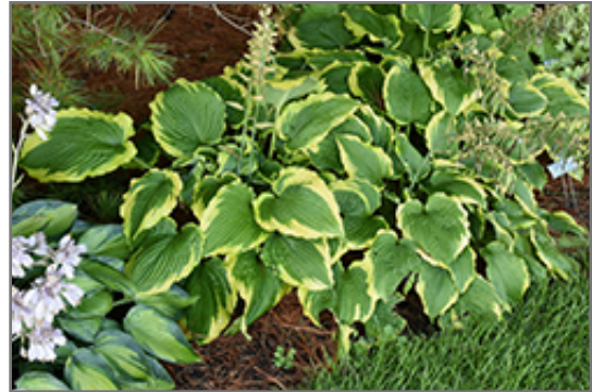
Spartacus Hosta

Spartacus Hosta is recommended for the following landscape applications;