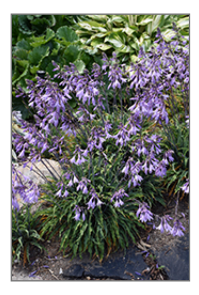
Silly String Hosta in bloom