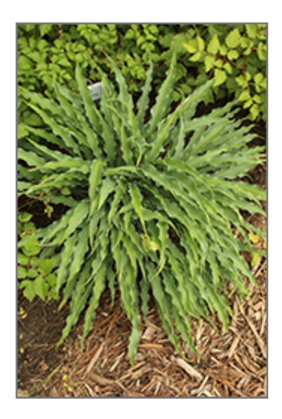
Silly String Hosta

Silly String Hosta is recommended for the following landscape applications;