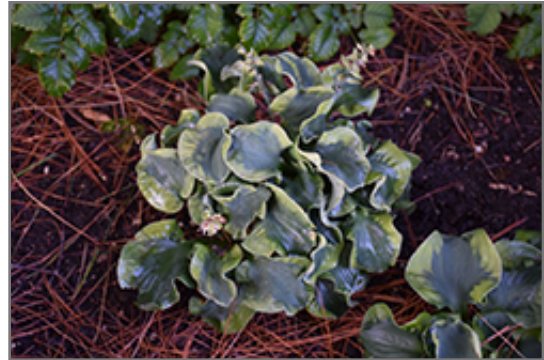
School Mouse Hosta