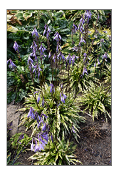
Party Streamers Hosta in bloom