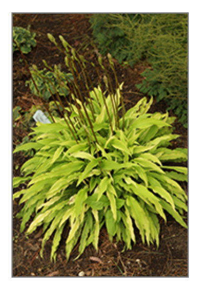
Party Streamers Hosta

Party Streamers Hosta is recommended for the following landscape applications;