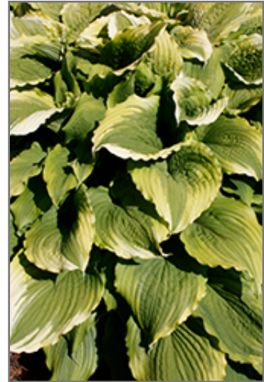
One Last Dance Hosta foliage