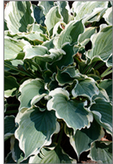
Shadowland Hope Springs Eternal Hosta foliage

Shadowland Hope Springs Eternal Hosta is recommended for the following landscape applications;