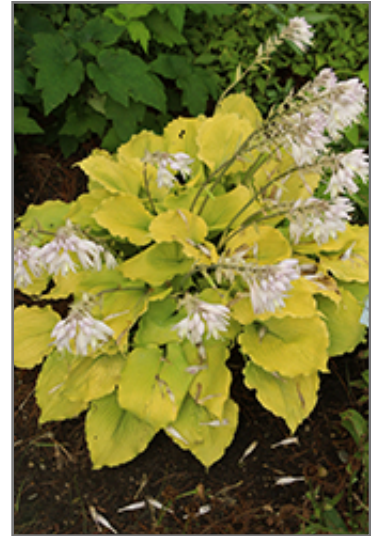
Shadowland Echo The Sun Hosta in bloom