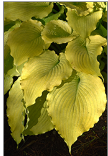
Shadowland Echo The Sun Hosta foliage