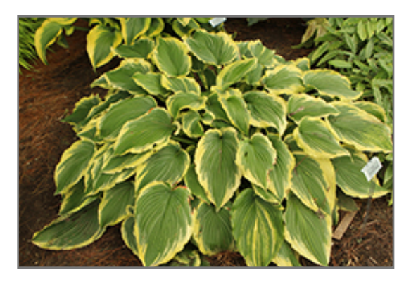
Drop Dead Gorgeous Hosta