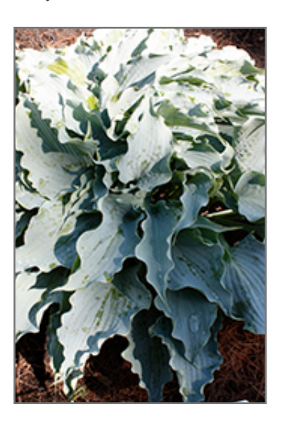
Dancing With Dragons Hosta foliage

This is a relatively low maintenance plant, and is best cleaned up in early spring before it resumes active growth for the season. Gardeners should be aware of the following characteristic(s) that may warrant special consideration;