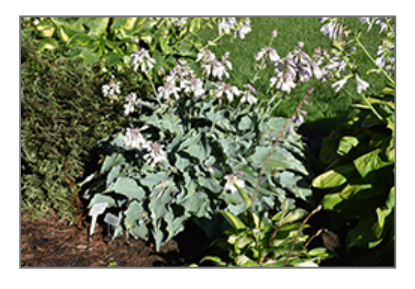
Dancing With Dragons Hosta in bloom

Dancing With Dragons Hosta is a dense herbaceous perennial with tall flower stalks held atop a low mound of foliage. Its relatively coarse texture can be used to stand it apart from other garden plants with finer foliage.