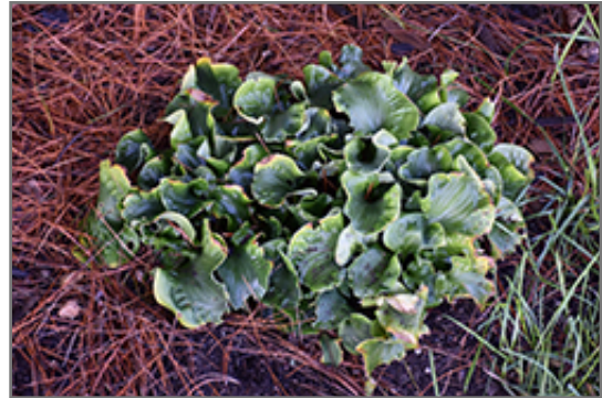
Church Mouse Hosta