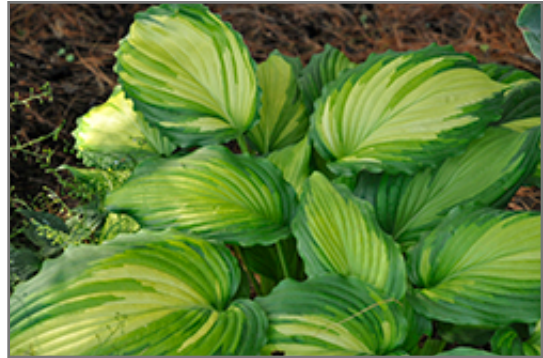
Angel Falls Hosta foliage