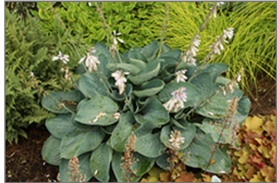
Shadowland Above The Clouds Hosta in bloom

Shadowland Above The Clouds Hosta is recommended for the following landscape applications;