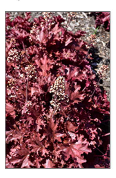
Ruby Tuesday Coral Bells flowers