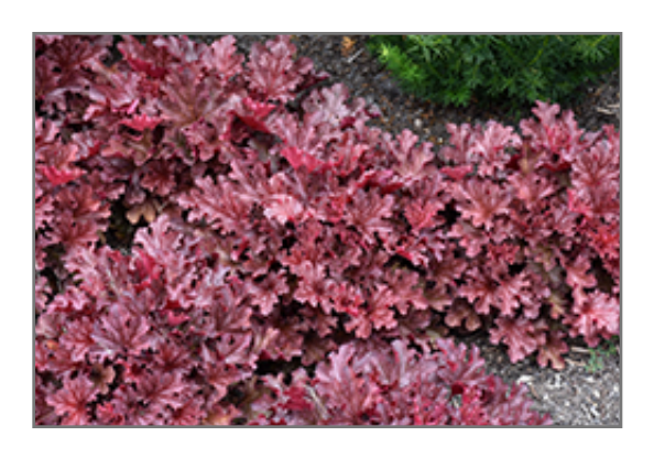
Ruby Tuesday Coral Bells

This is a relatively low maintenance plant, and should be cut back in late fall in preparation for winter. It is a good choice for attracting hummingbirds to your yard. It has no significant negative characteristics.