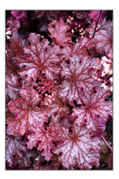
Ruby Tuesday Coral Bells foliage

Ruby Tuesday Coral Bells will grow to be about 9 inches tall at maturity extending to 16 inches tall with the flowers, with a spread of 14 inches. When grown in masses or used as a bedding plant, individual plants should be spaced approximately 12 inches apart. Its foliage tends to remain low and dense right to the ground. It grows at a medium rate, and under ideal conditions can be expected to live for approximately 10 years. As an evegreen perennial, this plant will typically keep its form and foliage year-round.