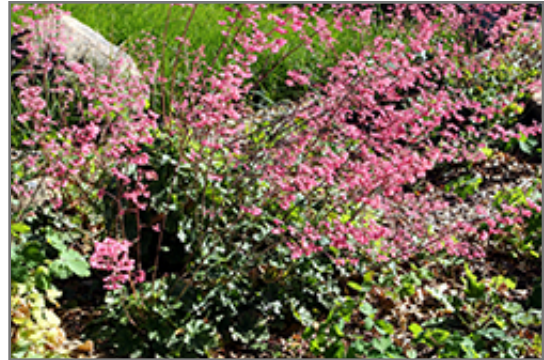
Canyon Belle Coral Bells in bloom

Canyon Belle Coral Bells is recommended for the following landscape applications;