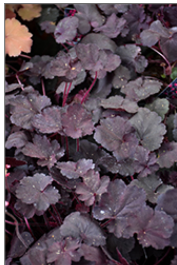
Black Forest Cake Coral Bells foliage