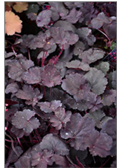
Black Forest Cake Coral Bells foliage