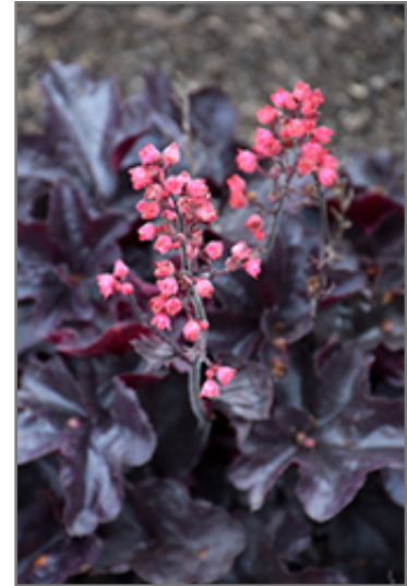
Black Forest Cake Coral Bells flowers

Black Forest Cake Coral Bells is recommended for the following landscape applications;