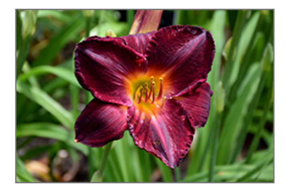
Tuscawilla Blackout Daylily flowers