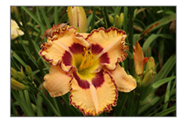
Rainbow Rhythm Lake of Fire Daylily flowers