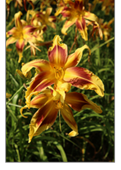
Lady Neva Daylily flowers

Exceptional blooms are soft buff yellow, with contrasting rose-red eye zones and green throats; unusual petals appear pinched or folded; sturdy, branching scapes, great grassy texture and form; impressive when massed in the garden or along borders