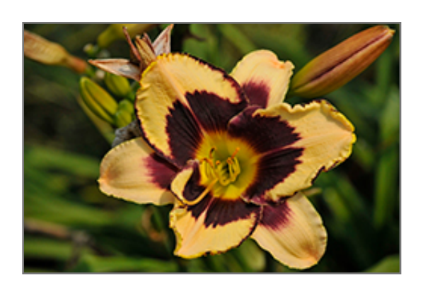
Inkheart Daylily flowers