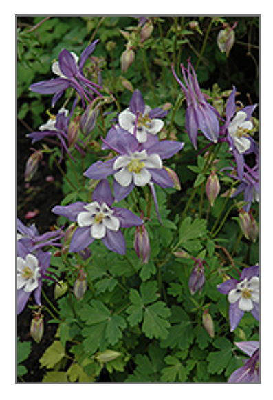
McKana Blue Columbine flowers

With striking bonnet-like flowers in bicolor mixes of blue with other bright colors, this giant columbine is stately in the garden; great for naturalizing areas and attracting wildlife