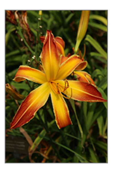
Firestorm Daylily flowers

This vibrant selection features huge, brick red, spider type blooms with golden yellow throats; sturdy, strong, easy to care for, great grassy texture and form; impressive when massed in the garden or along borders