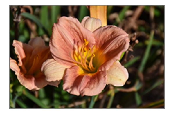
EveryDaylily Cerise Daylily flowers