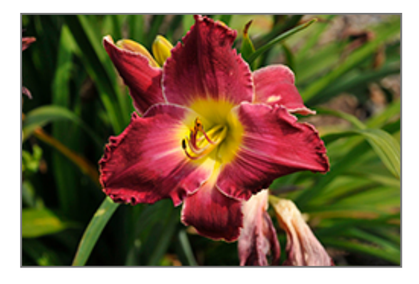
Blood Sweat And Tears Daylily flowers