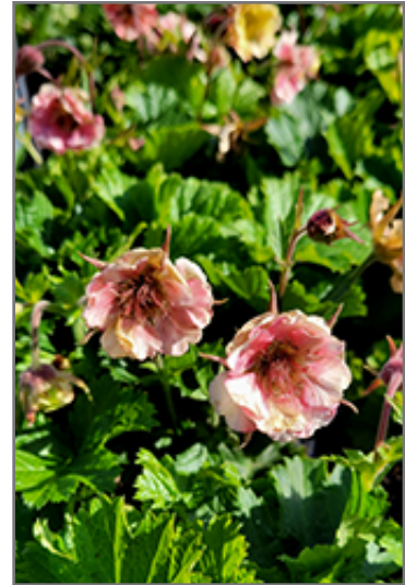
Cosmopolitan Avens flowers