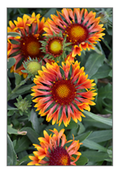
SpinTop Copper Sun Blanket Flower flowers

This plant will require occasional maintenance and upkeep. Trim off the flower heads after they fade and die to encourage more blooms late into the season. It is a good choice for attracting bees and butterflies to your yard, but is not particularly attractive to deer who tend to leave it alone in favor of tastier treats. It has no significant negative characteristics.