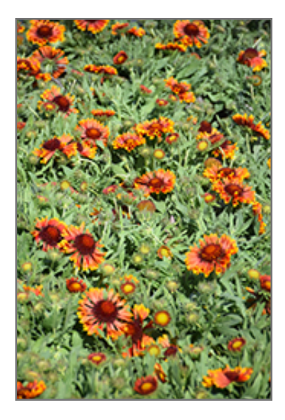
SpinTop Copper Sun Blanket Flower in bloom