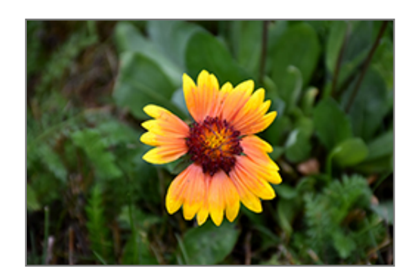
Blanket Flower flowers