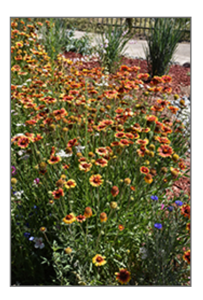
Blanket Flower in bloom

This plant will require occasional maintenance and upkeep, and is best cleaned up in early spring before it resumes active growth for the season. It is a good choice for attracting bees and butterflies to your yard, but is not particularly attractive to deer who tend to leave it alone in favor of tastier treats. It has no significant negative characteristics.