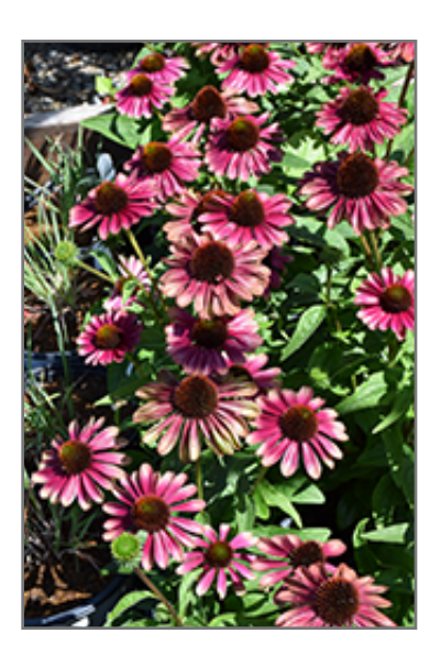
Sweet Sandia Coneflower flowers