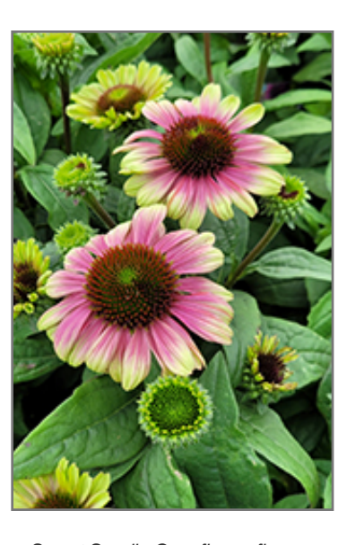
Sweet Sandia Coneflower flowers

Sweet Sandia Coneflower is recommended for the following landscape applications;