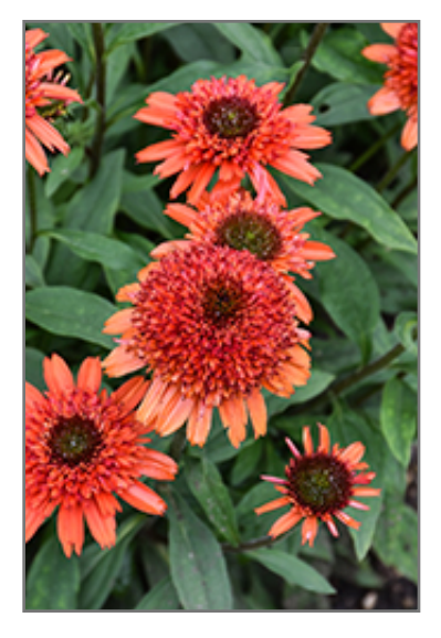
Moab Sunset Coneflower flowers

A stunning variety featuring large, fully double flowers with intense orange color that is sure to get attention; strong and bushy in habit, and ideal for sunny borders and mixed containers; deadhead spent blooms