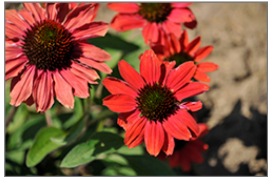
Color Coded Frankly Scarlet Coneflower flowers