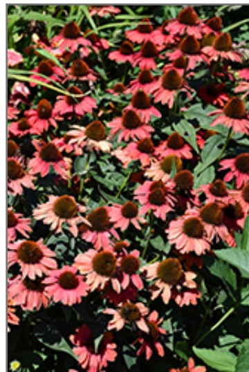
Color Coded Frankly Scarlet Coneflower flowers

Color Coded Frankly Scarlet Coneflower is an herbaceous perennial with an upright spreading habit of growth. Its medium texture blends into the garden, but can always be balanced by a couple of finer or coarser plants for an effective composition.