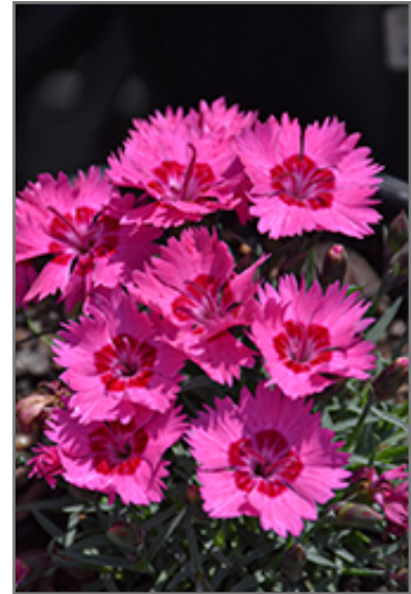
Paint The Town Fancy Pinks flowers

Paint The Town Fancy Pinks is a fine choice for the garden, but it is also a good selection for planting in outdoor pots and containers. It is often used as a 'filler' in the 'spiller-thriller-filler' container combination, providing a mass of flowers and foliage against which the thriller plants stand out. Note that when growing plants in outdoor containers and baskets, they may require more frequent waterings than they would in the yard or garden. Be aware that in our climate, most plants cannot be expected to survive the winter if left in containers outdoors, and this plant is no exception. Contact our experts for more information on how to protect it over the winter months.