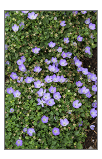
Delft Teacups Bellflower in bloom

A rounded, compact mound, covered with lovely blue and white cups that really stand out; perfect in rock gardens, along pathways or border fronts; a butterfly magnet; prefers consistent moisture, but not wet soil