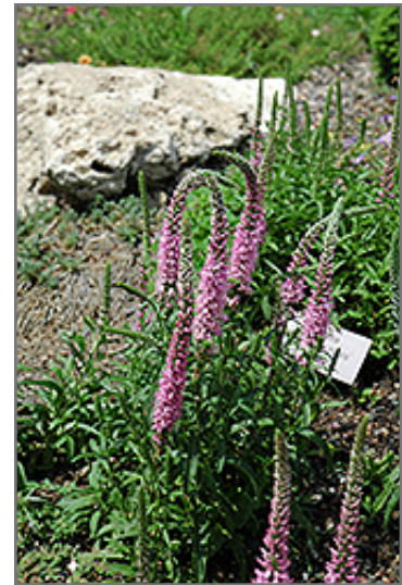
Giles van Hees Speedwell flowers

Giles van Hees Speedwell is recommended for the following landscape applications;