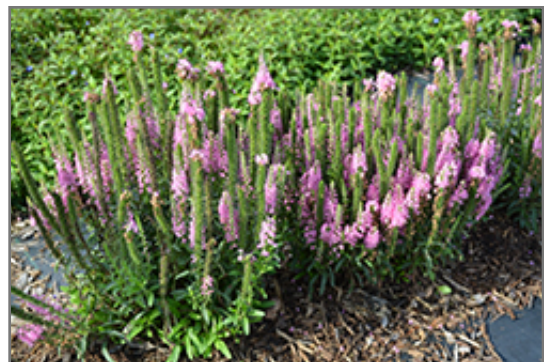
Giles van Hees Speedwell flowers