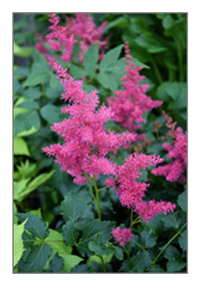
Younique Ruby Red Astilbe flowers