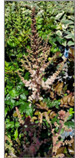
Pink Lightning Astilbe flowers

Pink Lightning Astilbe is recommended for the following landscape applications;