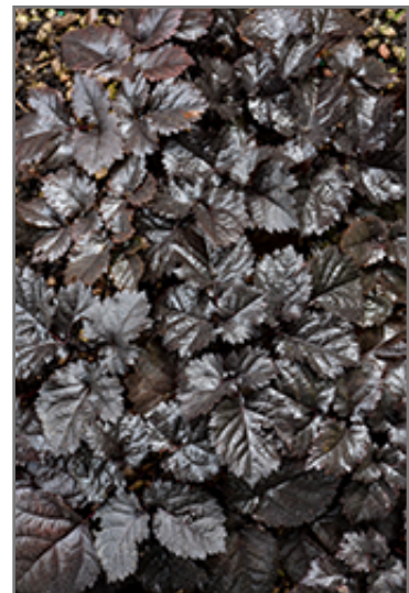
Dark Side Of The Moon Astilbe foliage