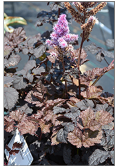
Dark Side Of The Moon Astilbe in bloom

Dark Side Of The Moon Astilbe is a fine choice for the garden, but it is also a good selection for planting in outdoor pots and containers. With its upright habit of growth, it is best suited for use as a 'thriller' in the 'spiller-thriller-filler' container combination; plant it near the center of the pot, surrounded by smaller plants and those that spill over the edges. Note that when growing plants in outdoor containers and baskets, they may require more frequent waterings than they would in the yard or garden. Be aware that in our climate, most plants cannot be expected to survive the winter if left in containers outdoors, and this plant is no exception. Contact our experts for more information on how to protect it over the winter months.