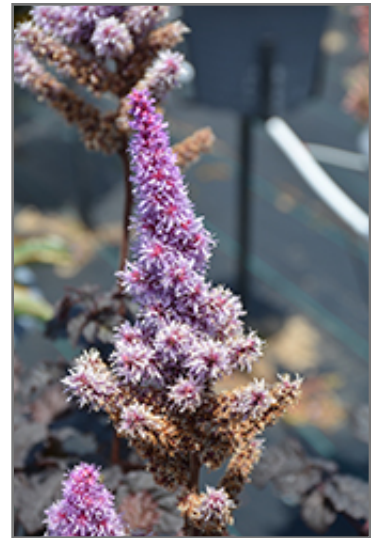
Dark Side Of The Moon Astilbe flowers

This is a relatively low maintenance plant, and is best cleaned up in early spring before it resumes active growth for the season. It is a good choice for attracting butterflies to your yard, but is not particularly attractive to deer who tend to leave it alone in favor of tastier treats. It has no significant negative characteristics.