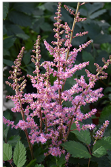
Veronica Klose Astilbe flowers