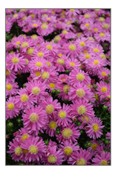
Kickin Carmine Red Aster flowers